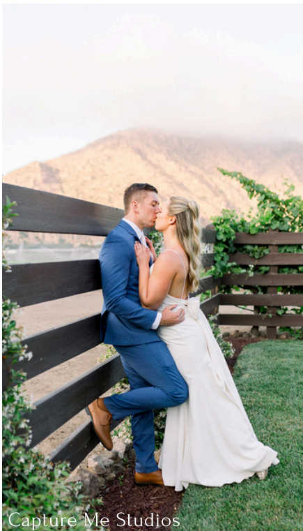
Capture Me Studios